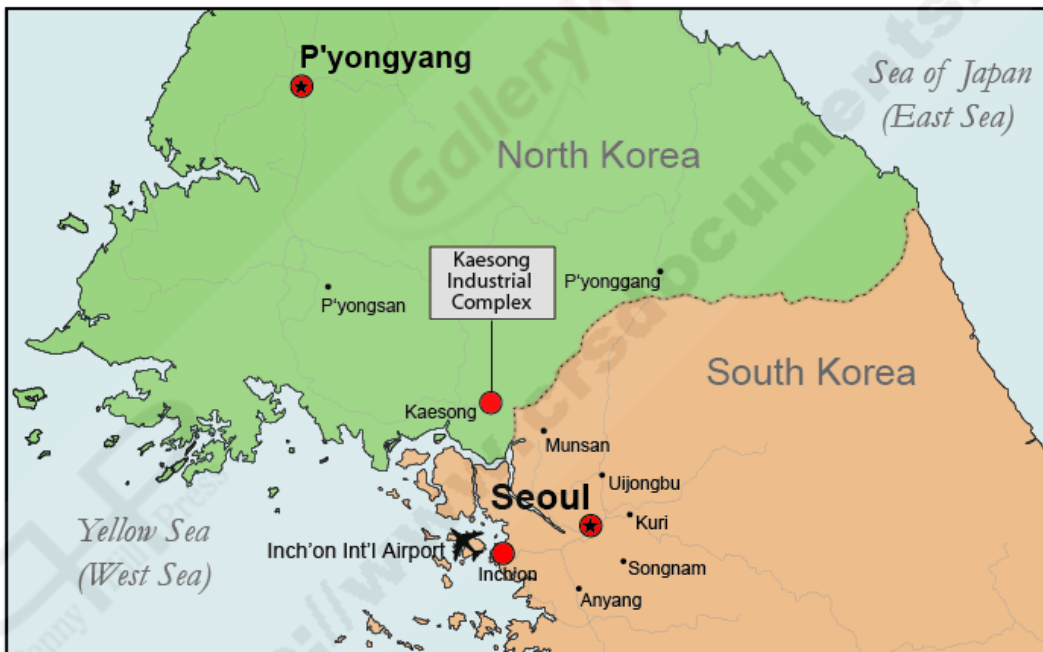
Figure 1. Location of the Kaesong Industrial Complex

Source: Map Resources. Adapted by CRS. 06/07