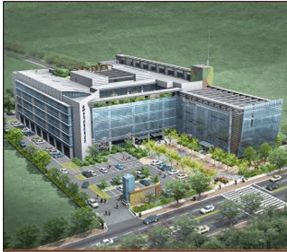
Figure 2. Leased Space Factory Building to be Constructed in the Kaesong Industrial Complex